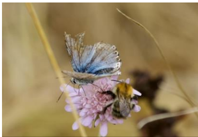
Butterfly & Bumblebee, Gordon Jackson

This National Landscape links together a chain of varied lowland landscapes including the North Downs. Rising near Guildford as the narrow Hogs Back, the ridge of the downs stretches away to the Kent border, an unmistakable chalk landscape of swelling hills and beech-wooded combes with a steep scarp crest looking south to the Weald. The downs are paralleled to the south by an undulating wooded greensand ridge, rising at Leith Hill to southeast England’s highest point (294m). In the west, sandy open heathland stretches away to the Hampshire border.