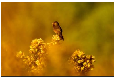
Dartford Warbler

The landscape is home to many iconic species such as the Nightjar, Dartford Warbler and Skylark which thrive on the varied habitat that the Surrey Hills offers. Careful management of the natural environment takes place by conservation bodies, landowners and farmers who have managed the land for generations. We regularly work with partners including the National Trust, Surrey Wildlife Trust, SCC Countryside, RSPB and others to fulfil our mission of protecting and enhancing the Surrey Hills.