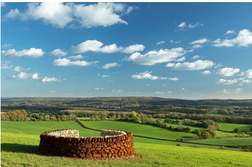
Inspiring View 'Cocolith', Titsey Estate (East Surrey Hills)